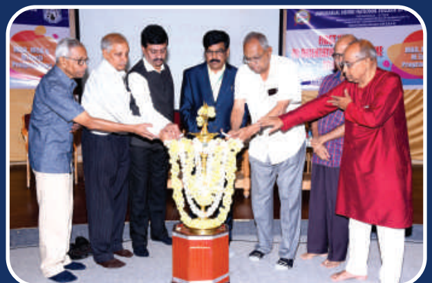
Orientation for 1 st Sem