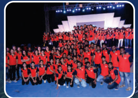
Utthana - UG Fest